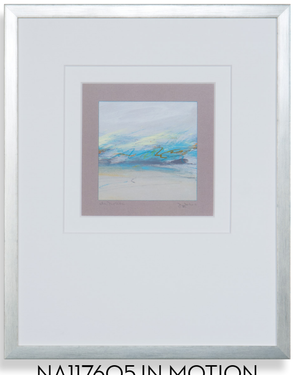
NA1176O5 IN MOTION